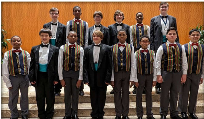
Our ChoirBoys (tuxed) with our friends of the Newark Boys Choir at the Georgia Boy Choir International Festival

It is important to realize that the mindset of a ChoirBoy has a direct effect upon his ability to be a contributing, productive and benefiting member of the BoyChoir. It is his attitude that will determine the amount of growth, pride and satisfaction which he receives from the experience. Our ChoirBoys tend to come from very supportive homes where parents take an active role in their son's life. As a boy progresses through the season, parental support becomes even more important. For example, it is interesting to note that a few boys think of leaving the BoyChoir in January of each year, or just after a major event such as a large concert. This downtime or "slump" is a result of the return to a rehearsal "working" mode following all the fun and excitement of a big event. Quite frankly, we expect artistic children to be occasionally "moody." Please know that with your encouragement and support it will pass. If you believe that your son's interest level may be decreasing or that there may be a problem, there are a number of things that can be done both in and out of rehearsal to help him through this brief phase. Please communicate observations and concerns with the ChoirMaster.