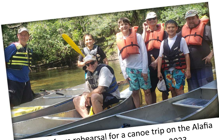
A break from rehearsal for a canoe trip on the Alafia River at Camp CedarKirk, Spring 2023

Fathers are encouraged to attend and assist with rehearsal camps. The boys are under close supervision of staff, parents, camp professionals, and select alumni at all times. As with all BoyChoir activities, safety is the top priority.