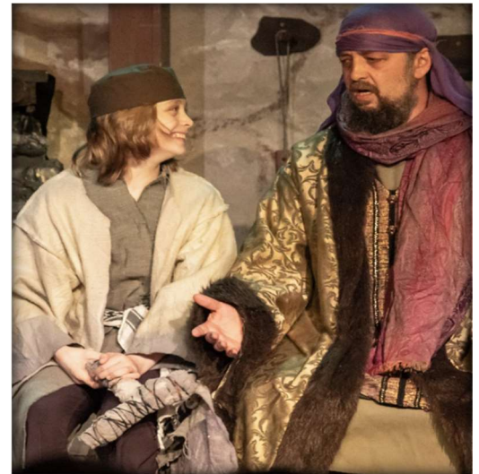
Amahl (above) and Tosca (below) with the St. Petersburg Opera (2022)

It is our policy to use parents as drivers for concerts and events that are within a ninety minute driving distance. For longer travel a bus may be chartered. We require that while transporting ChoirBoys, all are secured in seat belts (one per ChoirBoy) at all times. If you plan to stop en route to or from any event, please communicate your intention in advance for approval. The ChoirBoys may not be exposed to smoking, vapes or alcohol at any time. Drivers must be fully insured and in compliance with legal requirements.