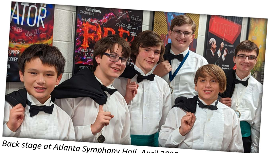
Back stage at Atlanta Symphony Hall, April 2022

It is the intention to again host another festival when the organization is ready. Boys will be selected from each of our choirs to represent our organization in the combined Festival Finale Concert and to attend all festival events.